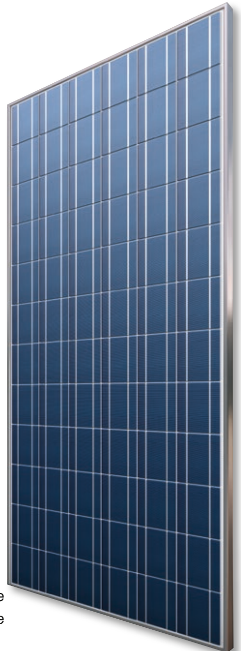
Fig. similar 72PUSA180724A

IP 67 High quality junction box and connector system for a longer life time